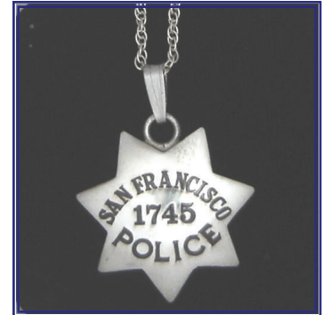
Solid Sterling Charm and Chain